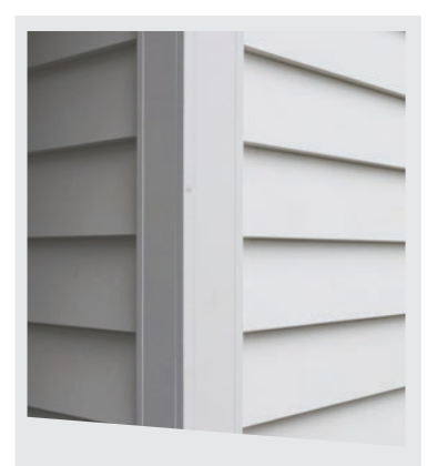
WEATHERBOARD CLASSIC REBATED BEVELBACK