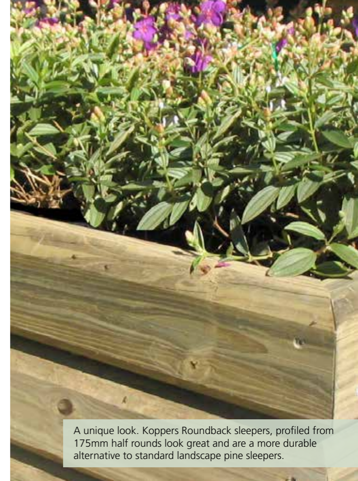
A unique look. Koppers Roundback sleepers, profiled from 175mm half rounds look great and are a more durable alternative to standard landscape pine sleepers.

Koppers log products are available in a wide range of sizes (diameters) and lengths. Look for the Koppers brand tag on the end of the log – your reassurance you are selecting a genuine Koppers log product.