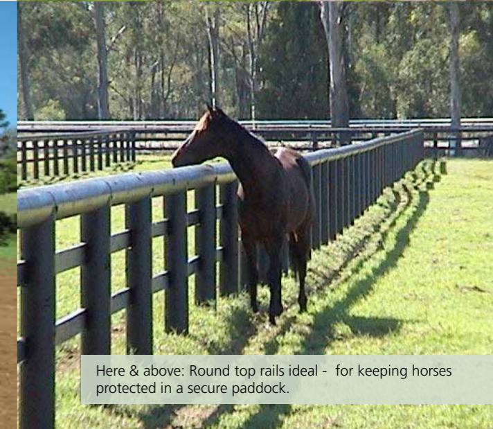
Here & above: Round top rails ideal - for keeping horses protected in a secure paddock.