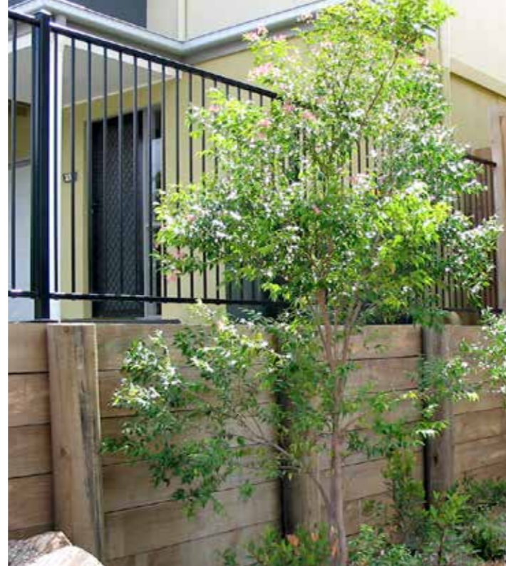
Cantilever retaining walls using Koppers perfect round posts, ideal for residential boundary soil stabilisation.

Koppers log products have been used extensively throughout Australia to great effect in retaining walls for embankment and soil stabilisation, and can be configured in a number of styles such as cantilever style walls, crib lock, tieback or palisade walls. Your Koppers stockist can help with construction details for a diverse range of projects, some of which are shown here. For heavy duty retaining wall design and approvals please check your local council requirements – you may need an engineer certified design to be approved by council prior to construction.