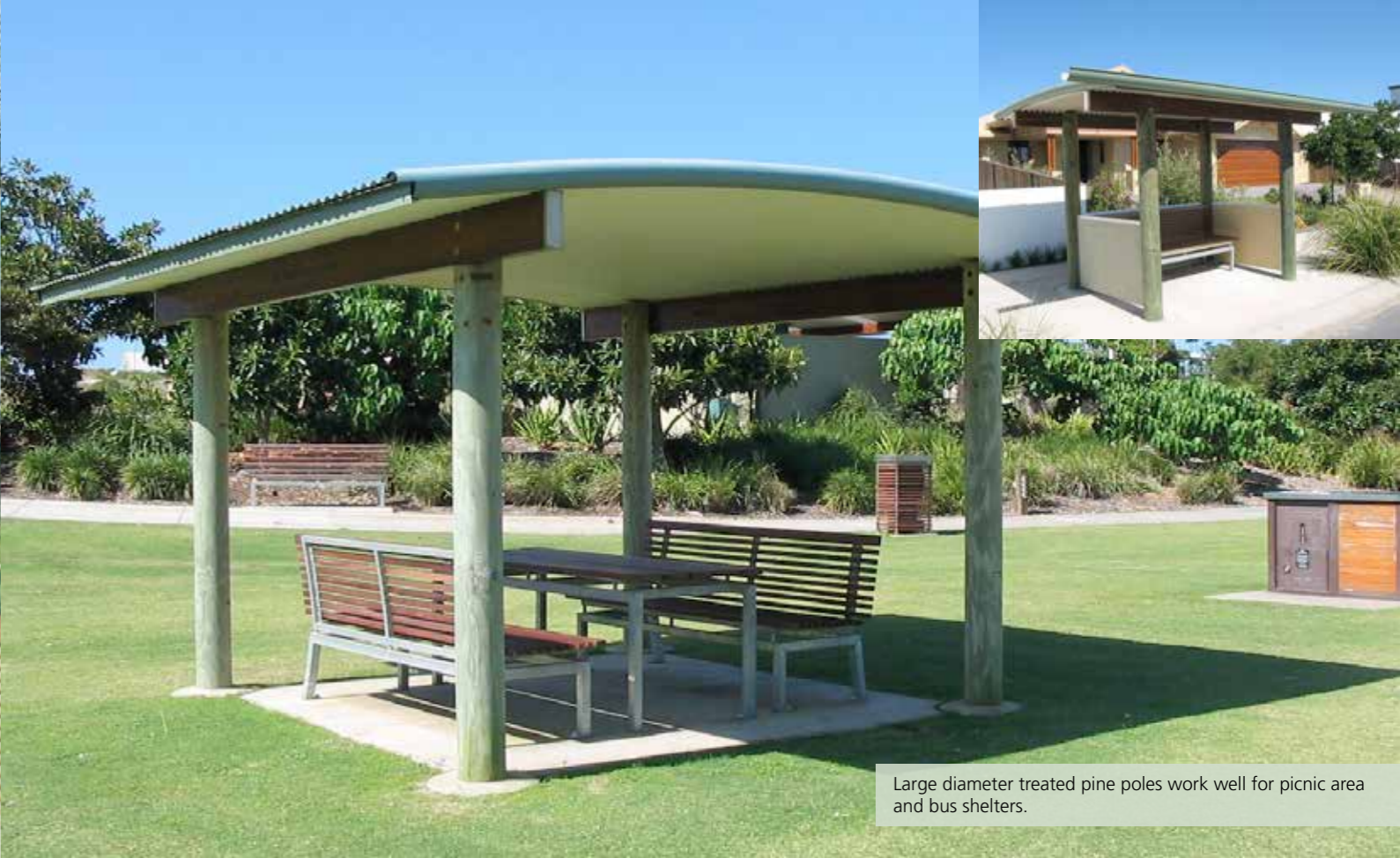
Large diameter treated pine poles work well for picnic area and bus shelters.