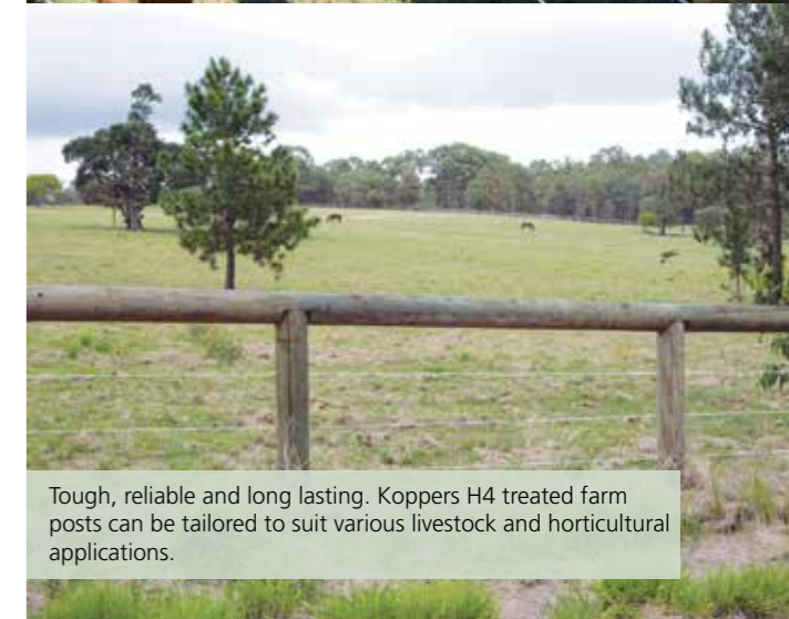
Tough, reliable and long lasting. Koppers H4 treated farm posts can be tailored to suit various livestock and horticultural applications.