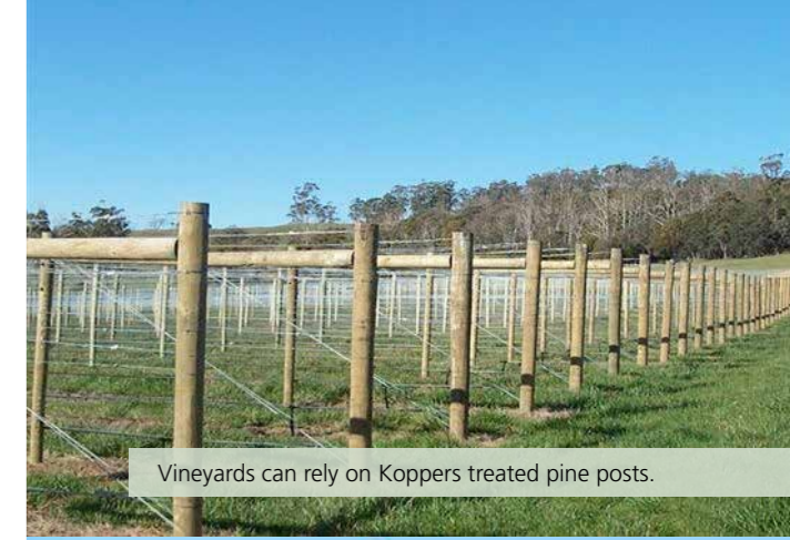
Vineyards can rely on Koppers treated pine posts.

Koppers treated pine (cambio debarked) logs are also used for vineyard trellising and foundation 'mini' piles – refer to Koppers website for more information about piling products.