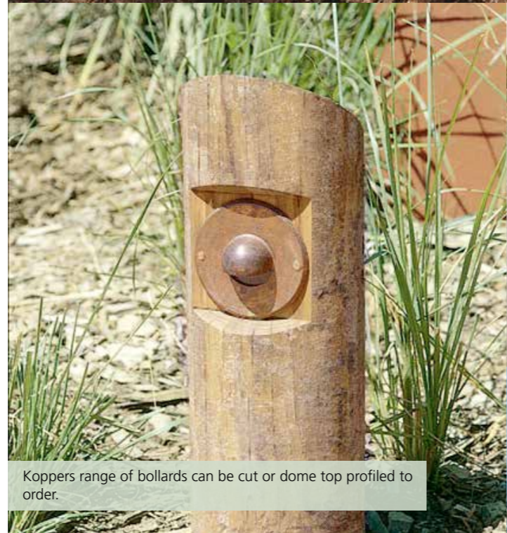
Koppers range of bollards can be cut or dome top profiled to order.