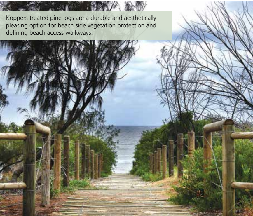
Koppers treated pine logs are a durable and aesthetically pleasing option for beach side vegetation protection and defining beach access walkways.