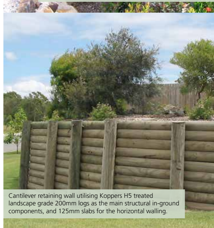
Cantilever retaining wall utilising Koppers H5 treated landscape grade 200mm logs as the main structural in-ground components, and 125mm slabs for the horizontal walling.