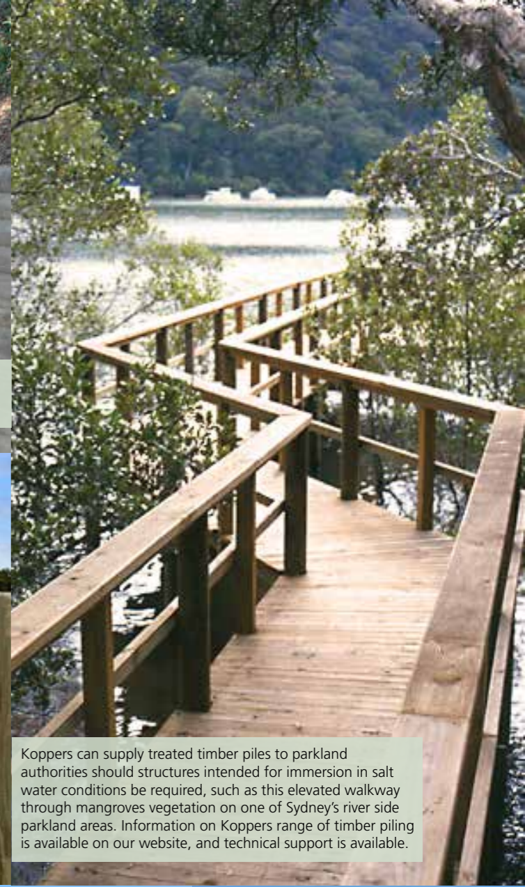
Koppers can supply treated timber piles to parkland authorities should structures intended for immersion in salt water conditions be required, such as this elevated walkway through mangroves vegetation on one of Sydney's river side parkland areas. Information on Koppers range of timber piling is available on our website, and technical support is available.