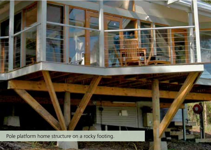
Pole platform home structure on a rocky footing.