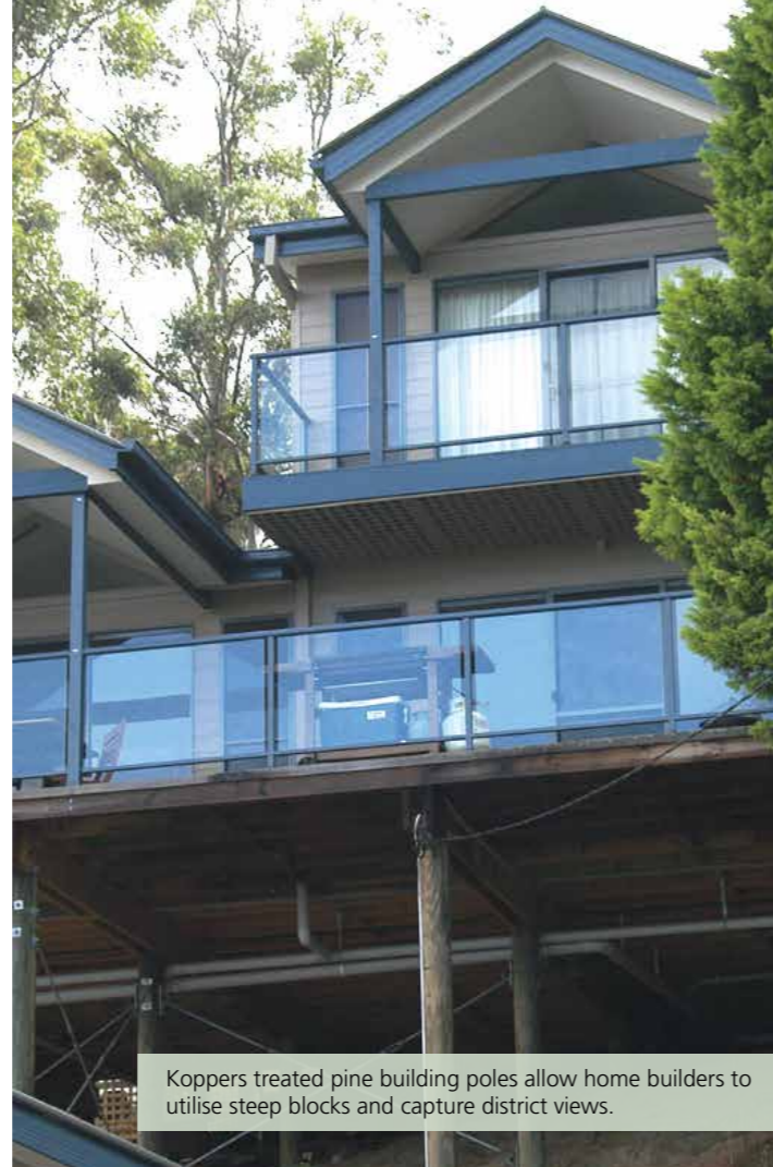
Koppers treated pine building poles allow home builders to utilise steep blocks and capture district views.

For more information about Koppers building poles see the technical data sheets page on our website.