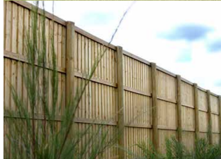
Koppers 125mm slab profiled perfect rounds make a functional and attractive option for post and rail fencing.