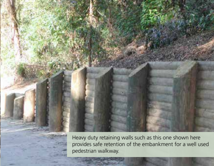
Heavy duty retaining walls such as this one shown here provides safe retention of the embankment for a well used pedestrian walkway.