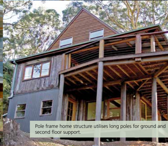
Pole frame home structure utilises long poles for ground and second floor support.